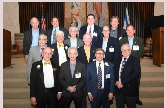
THIS PAST DECEMBER