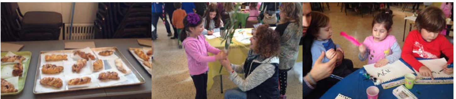
The Baking is always fun at Habonim School Celebrating Succot at Habonim School