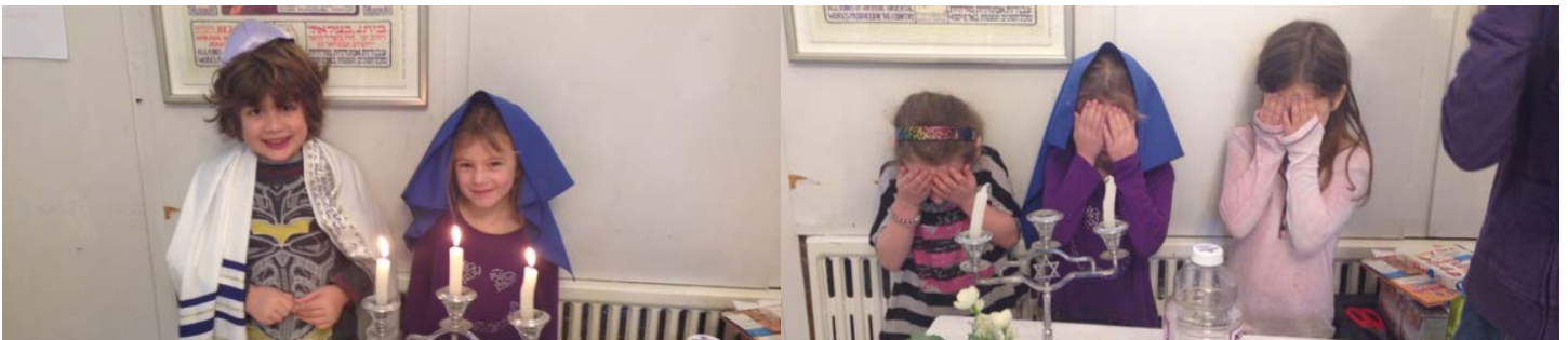
Learning about Shabbat at Habonim school