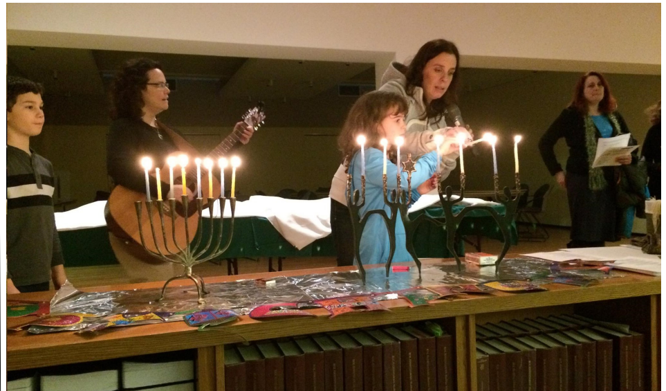
Havuruhniks came together to celebrate Chanukah together in 2016. This year, we will gather for Chanukah at 4:30 pm on Sunday, December 10 at Havurah. Learn more/RSVP.