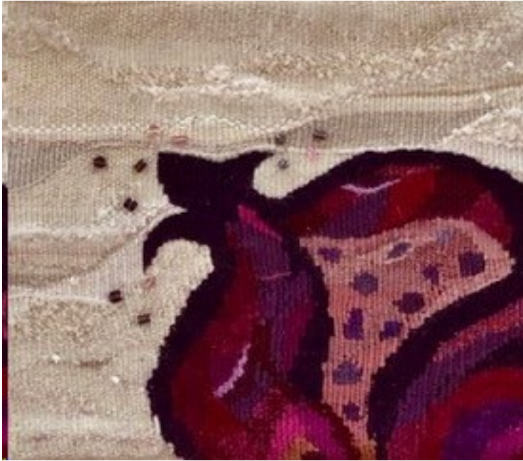
Leah Hershey Pomegranate Tapestry