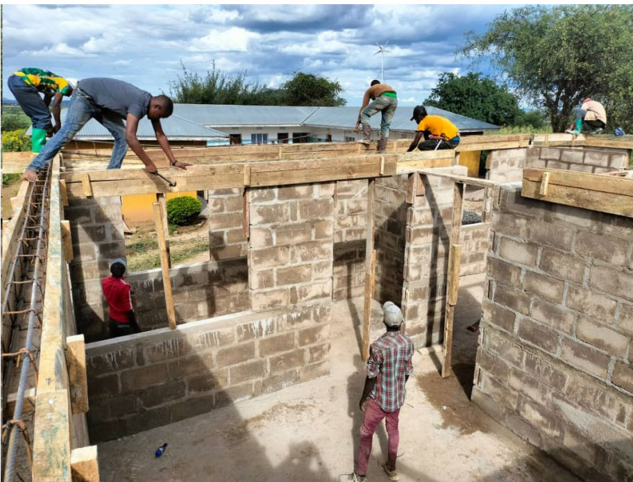
In Dumbeta Ward, people construct the new school kitchen.