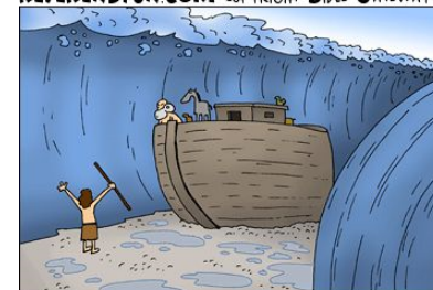
02-07-2014 MOSES AND NOAH HAVING AN ARGUMENT