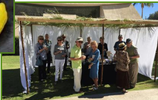
Kiddush in the Sukkah