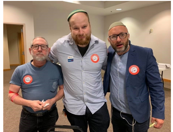
Todah Rabah to the many wonderful donors at the May blood drive.