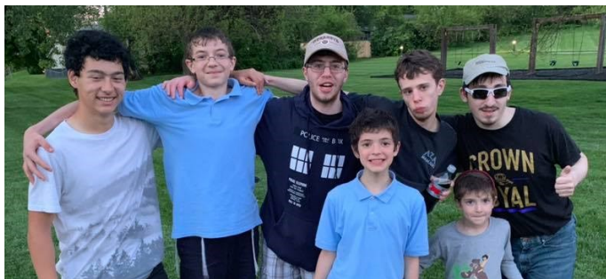
Fun was had by all with s'mores, stories, archery, music, BBQ, and of course the epic bonfire.