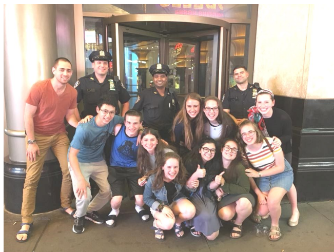
A great time posing with three New York police officers