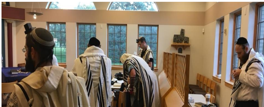
Beth Israel's amazing morning minyan continues to grow each week. Make it a great start to your day!