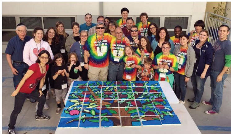
Photo from our last congregational retreat on February 19, 2018

https://www.templeanajose.org/event/CongregationalRetreat2024