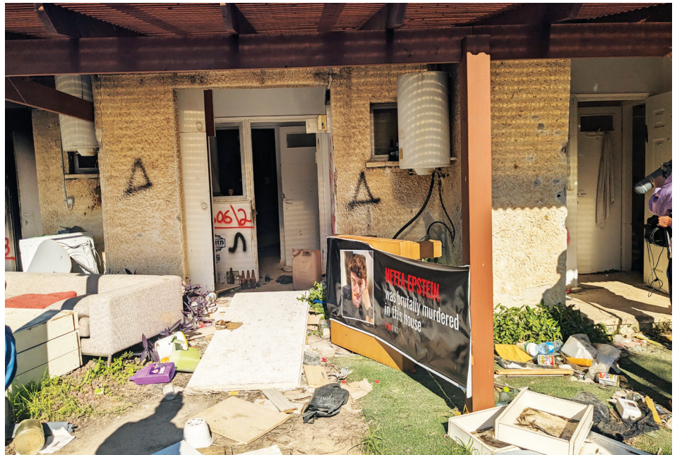
Above left: The sprawling headquarters of "Brothers in Arms," an all-volunteer nonprofit group that collects and distributes supplies to soldiers and displaced residents of Israel, is located in a parking garage under the Tel Aviv Convention Center. Above right: A small home in K'far Aza that was destroyed by Hamas terrorists on October 7. Below: At 'Hostages Square' in Tel Aviv, the group joins in a nightly prayer circle for the families of those taken captive that is organized by our Israeli colleagues.