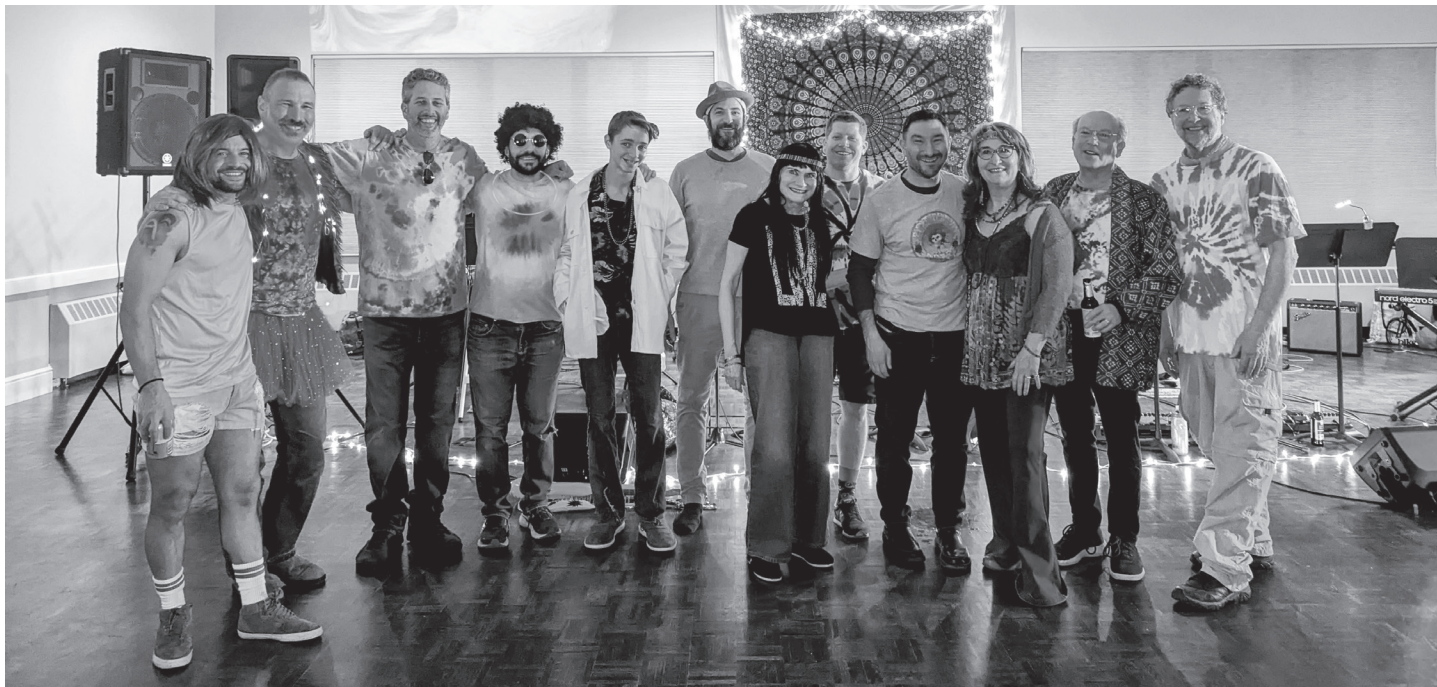
Above: Members of the K.I. Band pose in their tie-dyed costumes last year. For more photos of the band and other Purim treats, turn to page 16.