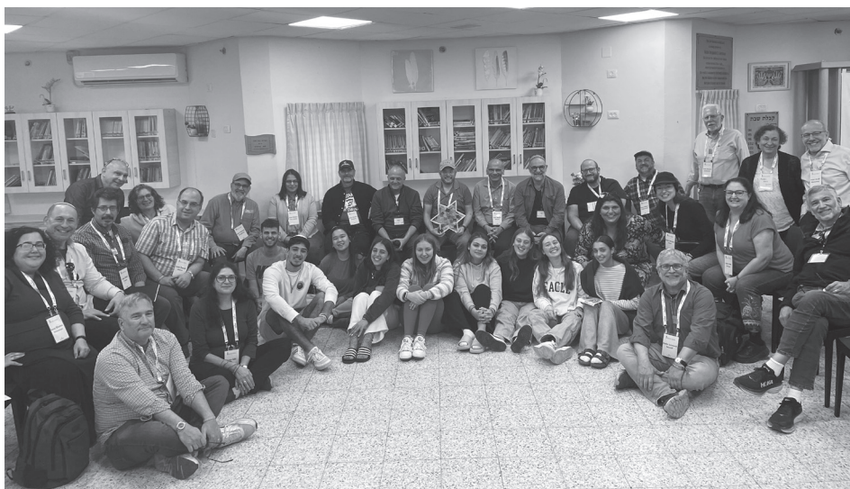
The Rabbinical Assembly mission visits Neve Hannah, a residential school in Kiryat Gat for children from troubled homes in the south of Israel. Also pictured here are several young people who work as counselors in the program.

Together with a dozen Israeli colleagues, the group visited Kfar Aza, one of the kibbutzim in the Gaza Envelope destroyed by Hamas terrorists on October 7. Walking on the lanes of the town, able to see the fences dividing Israel from Gaza — both the one that was knocked down during the attack and the new one that has been built — and plumes of smoke over Gaza City, we learned how Hamas invaders not only murdered and kidnapped and raped and terrorized, but how they did so with precise planning, intending to trigger every aspect of inherited Jewish trauma. The morning was devastating, more intense for me than visiting sites of Nazi atrocities in Europe or racial violence in the American South.