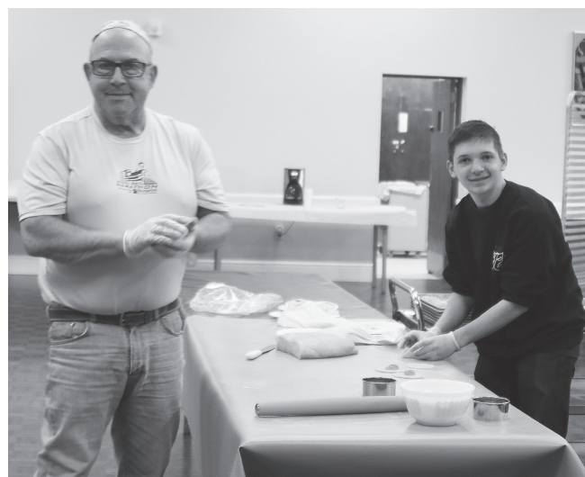
Volunteers assemble and bake hamantashen for K.I.'s annual fundraiser.

While the ordering deadline has passed, and once all orders are filled, any extra hamantashen will be available for purchase. Watch for details on how to order. Cost: $16 per dozen. We will publish a final tally for this project—including all the volunteers, the final numbers, etc. in a future issue of Kol K.I. Thank you to all who assisted with this winter fundraiser project which supports Kneset Israel, its programs, classes, and services.