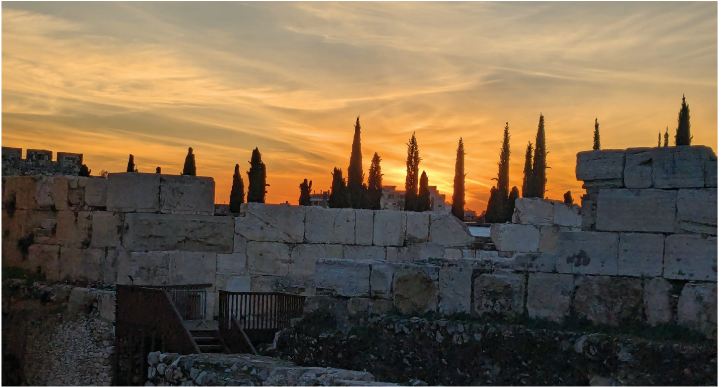
Above: The sun rises over Jerusalem. Below: Dawn at the Families Section of the Western Wall.