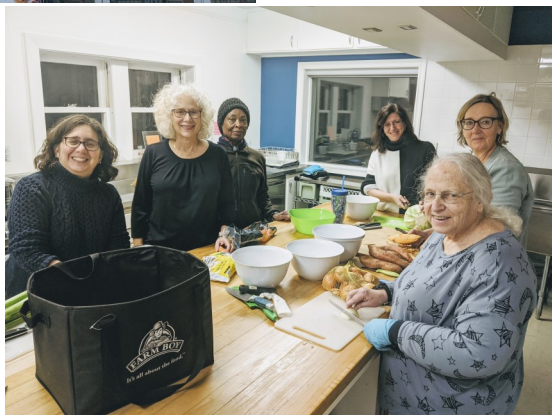
Soup making is a regular part of the work of the Social Action Committee