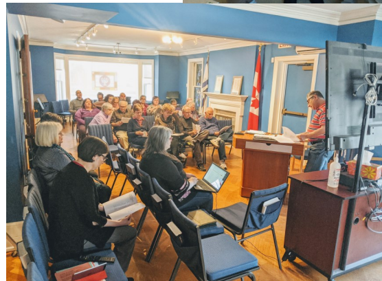
Temple Israel Annual Meeting