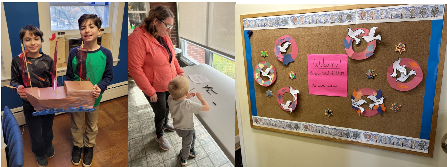
Tot Shabbat October 2023

Our religious school has been off to a great start! Families participated in our recent family Shabbat service on Nov 3. Our first kindergarten session was in October and the kids learned more about where their Hebrew name comes from and creating letters out of natural materials. Our youth group had its first session of the year in October as well. Some of our teens will be turning our old Hebrew workbooks into new recycled paper in the next few weeks.