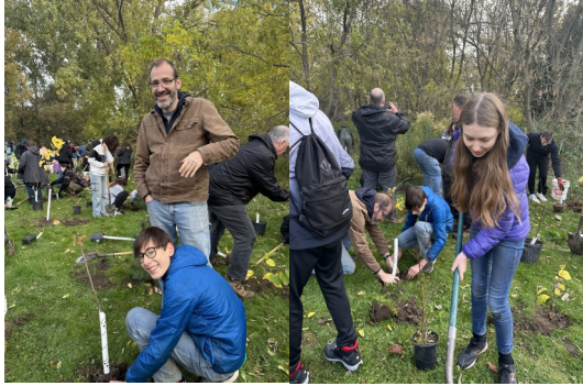
Interfaith Tree Planting - Oct. 22, 2023