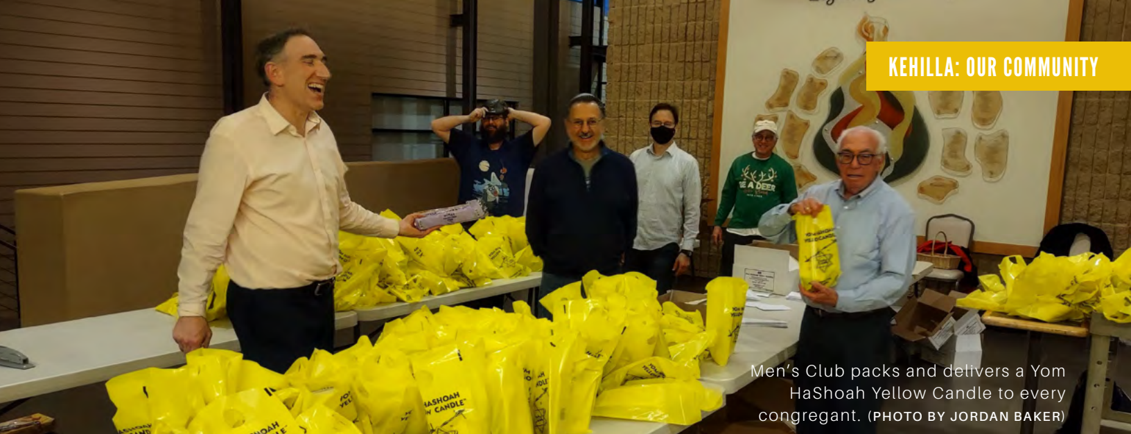
Men's Club packs and delivers a Yom HaShoah Yellow Candle to every congregant.