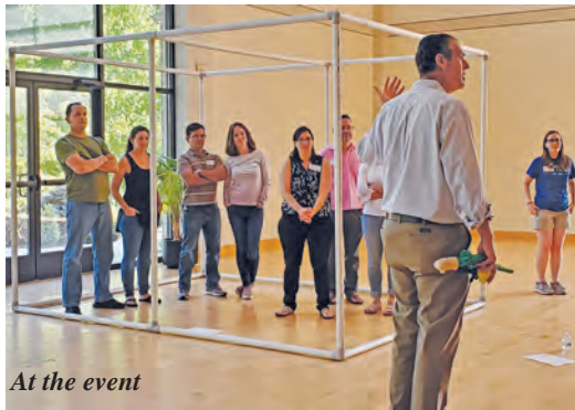
At the event

In September 2018, congregations and Jewish organizations across the region received an exciting email from the Jewish Federation of Greater Washington, asking for proposals about how Federation could invest in communities in a new way, to “encourage greater collaboration among organizations, increase engagement, and enhance community building.”