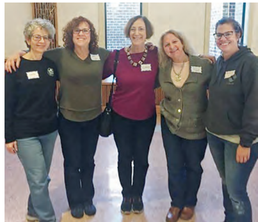
The OT Power Pack Team