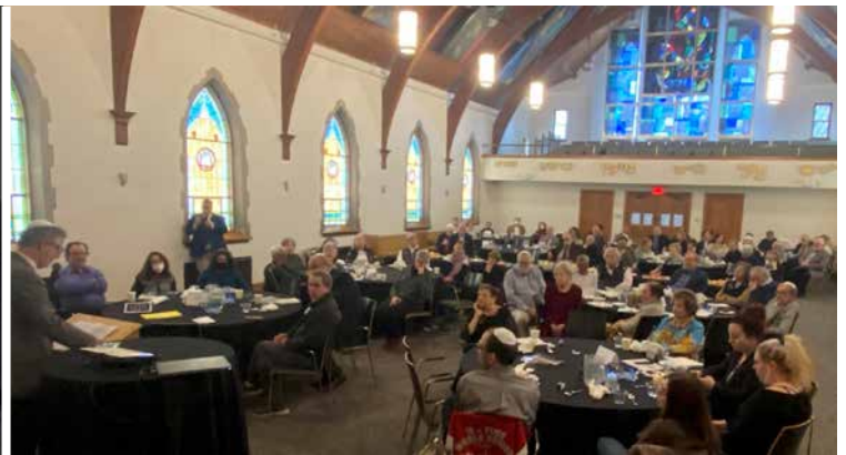
Man and Woman of the Year Award Dinner

Celebrate Lag B'Omer with Kol Rinah & the J at Shaw Park