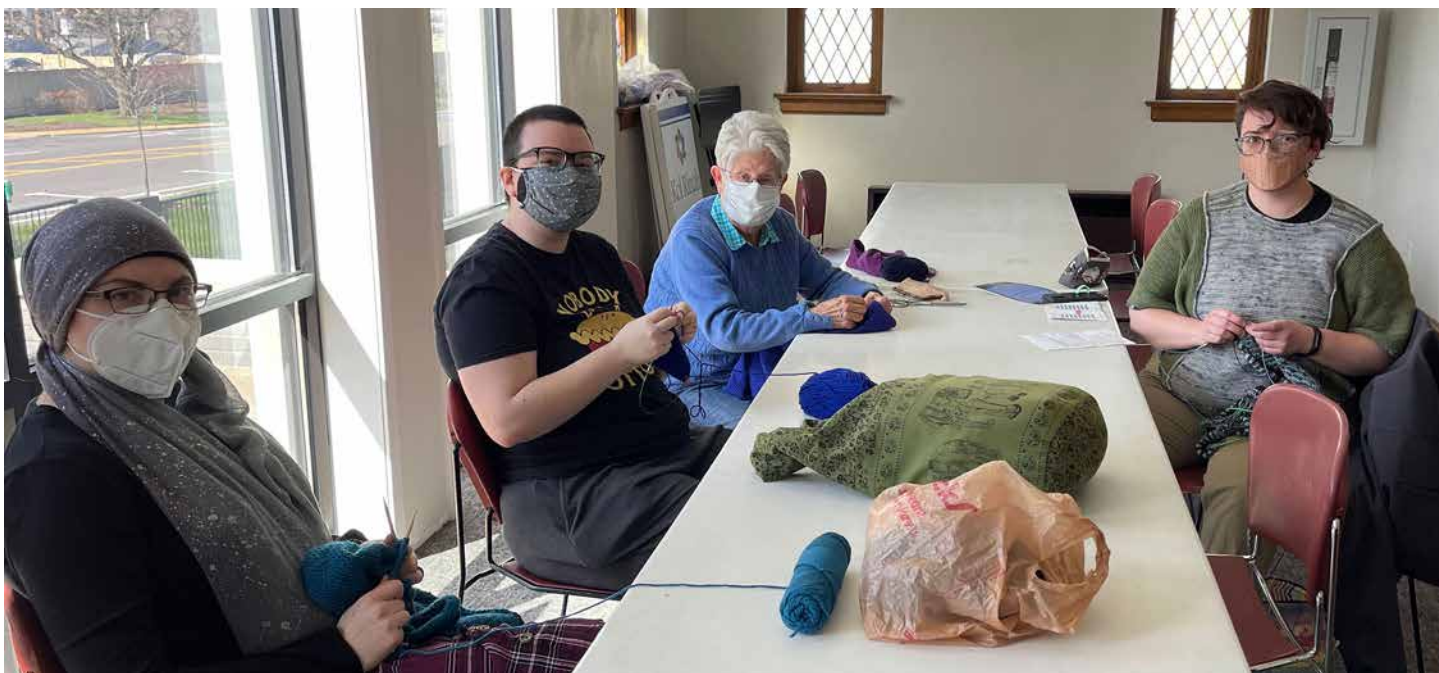
March Stitch and Shmooze

A lot is happening at Kol Rinah. Click on each of these ongoing items to learn more.