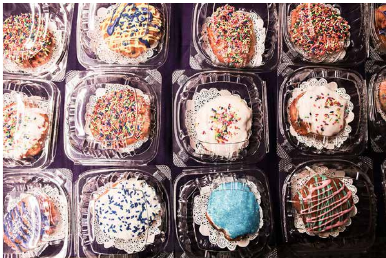
Donors Night Hannukah Dinner