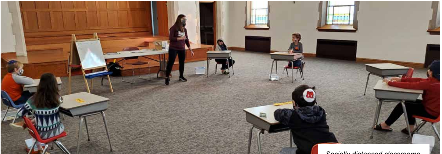
Socially distanced classrooms

Bring a can of food for the food pantry.