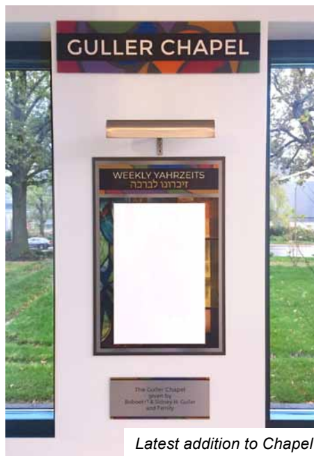
Latest addition to Chapel