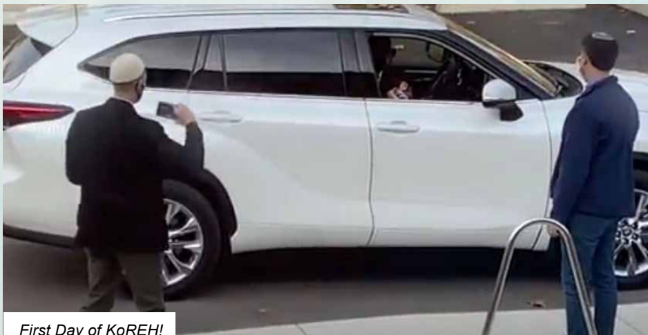
First Day of KoREH! more photos on p.11