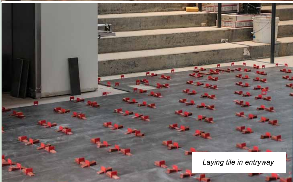
Laying tile in entryway