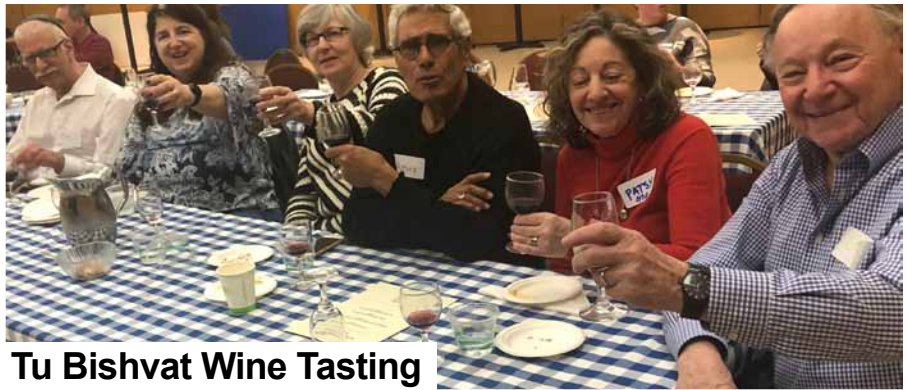
Tu Bishvat Wine Tasting