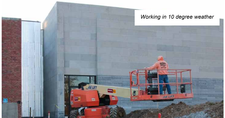
Working in 10 degree weather