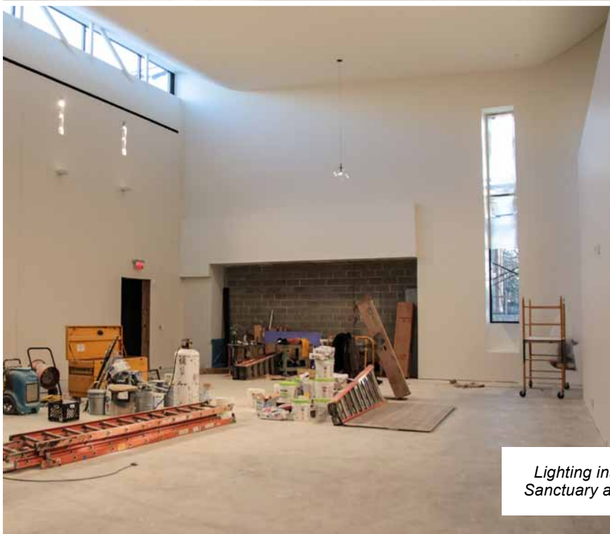
Lighting installed in the Sanctuary and Social Hall