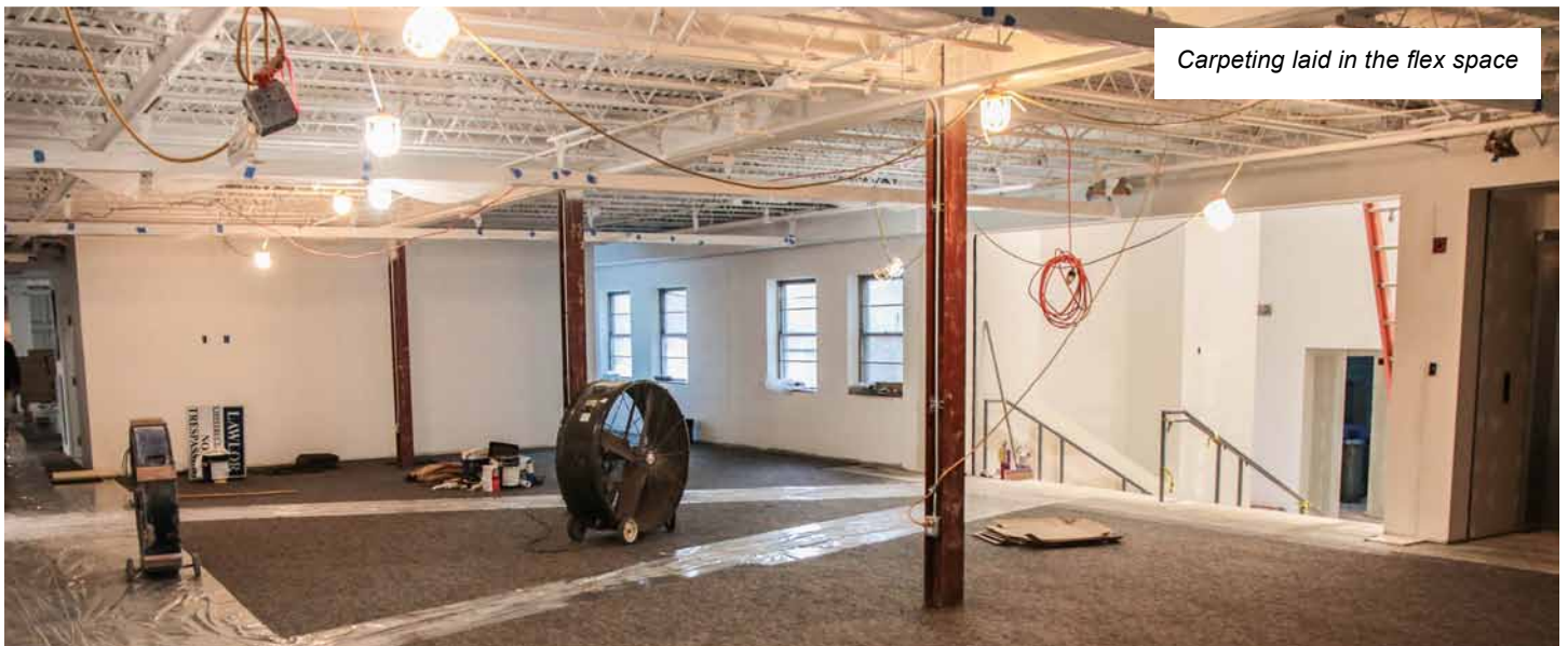
Carpeting laid in the flex space