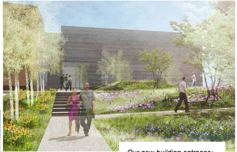
Our new building entrance: rendering with landscaping and under construction