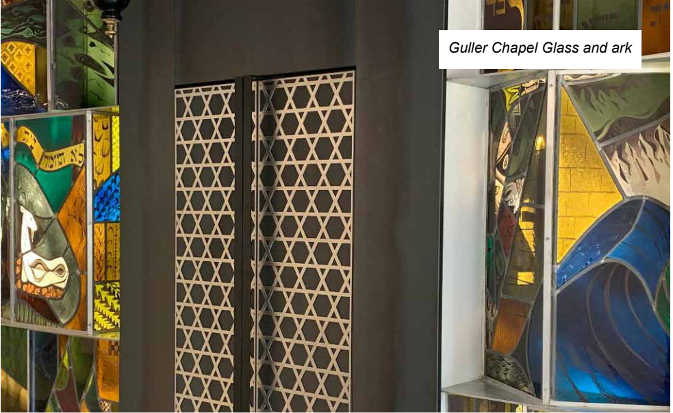
Guller Chapel Glass and ark

Take an online guided tour with Randi and Sherri! click here or go to https://www.kolrinahstl.org/onthemove/construction