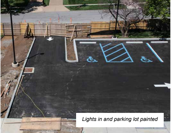
Lights in and parking lot painted

More pictures and info can be found on our website KolRinahStL.org .