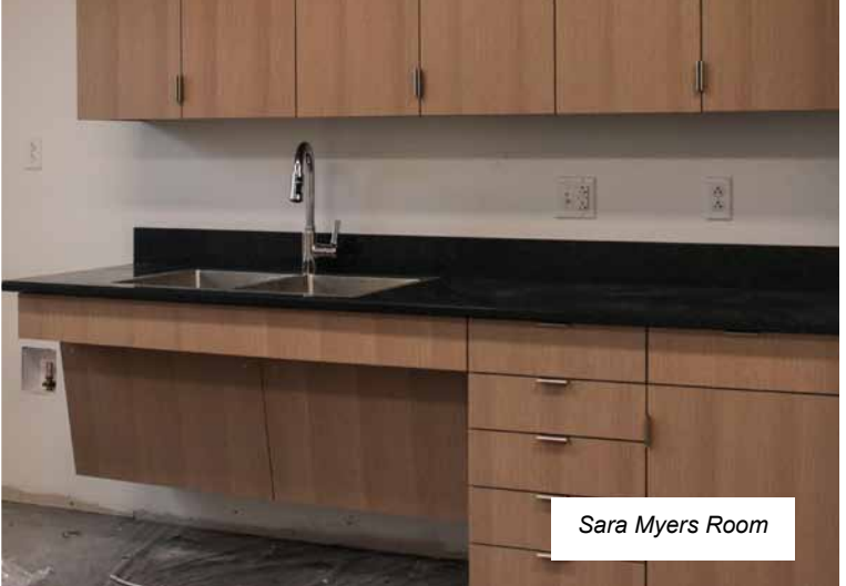
Sara Myers Room