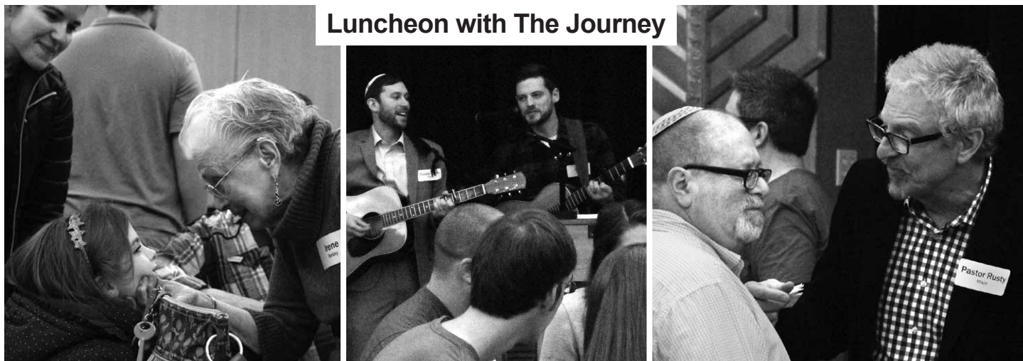
Luncheon with The Journey

Individuals may bring food into the building for their own personal consumption. That food is not permitted in the kitchen or in any room at any time when food is being served.