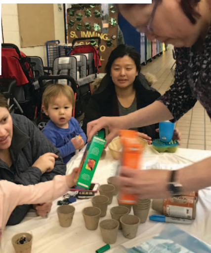
Painting with a Tu Bishevat Twist