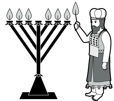
Why the ark and the 7 branch Menorah with Kohain Gadol? The answer is in the February Parshiot.