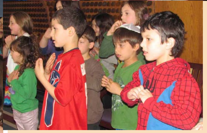
Singing with Ruach (spirit)