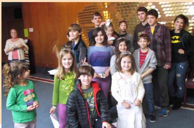
Some of our Service Attendees! Silver Chai Club (18 or more services attended)

School was rockin' as we celebrated together!