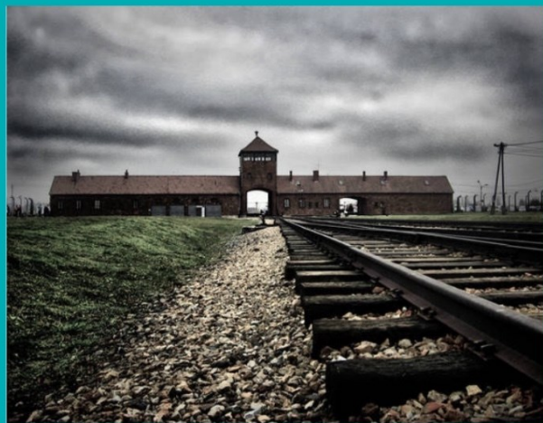
THE WORLD THAT WAS FHJC POLAND TRIP OCT 28 - NOV 3, 2019

Please contact Rabbi Elie at rabelie@fhjc.ca to register or for more details.