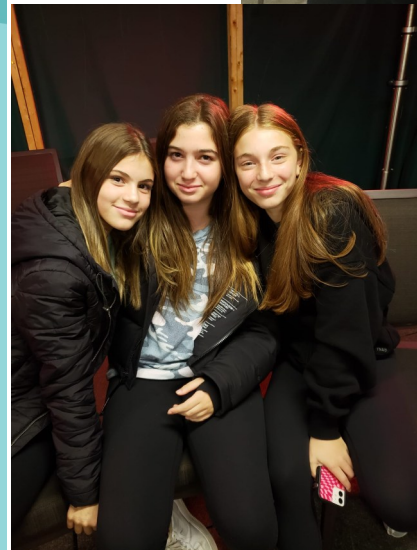
FHJC Teens with a Comedian- Hypnotist in the Centre's sukkah.