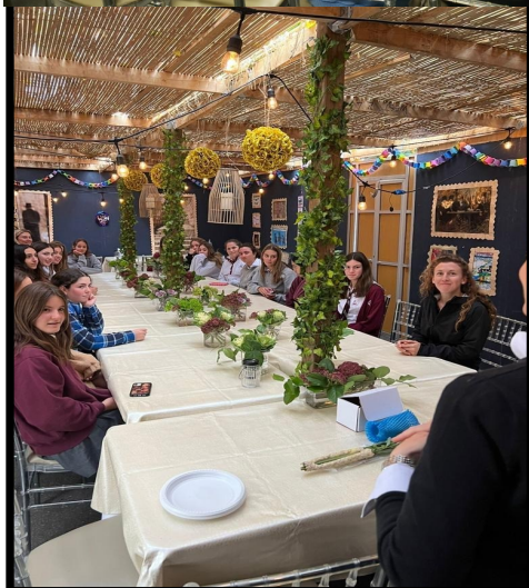
BSS Jewish Club enjoying the Rabbi's Suk- kah over the Chag