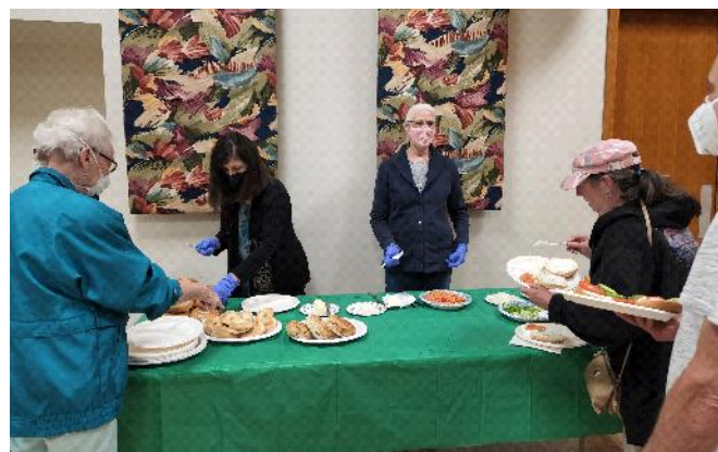
Jewish Federation Lunch and Learn Bunch - May 2022