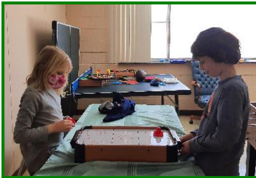
Enjoying our teen lounge