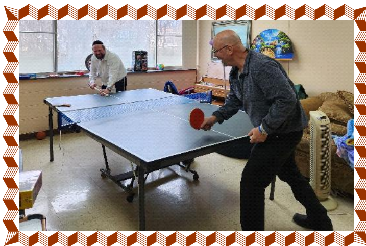
Enjoying the Teen Lounge

March 28, Evergreen Delivery for Pesach NOTE: orders must be placed by noon March 27.