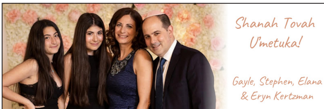
Sample template of NEW personalized family greeting