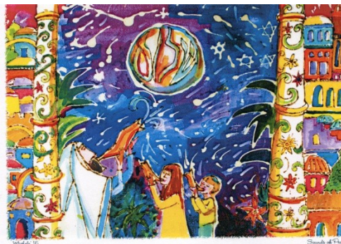
Last Year's Card Art