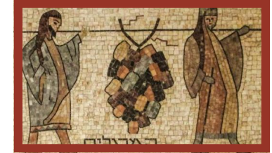
The command to send spies to survey the land. A mosaic in Or Tirah Synagogue, Acre, Israel.

The latest time to say the Shema is 8:55am.