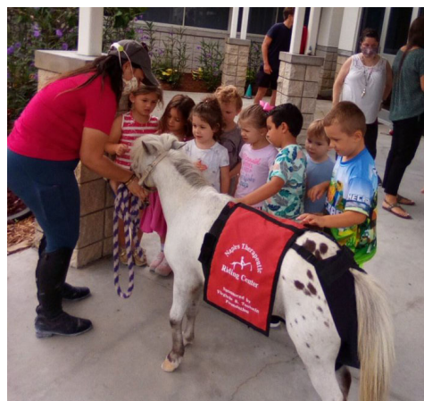
Animal Encounters Week