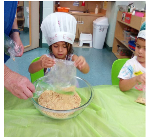
Our "Little Chefs" preparing Israeli chocolate balls.