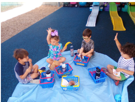
Summer picnic on the playground.