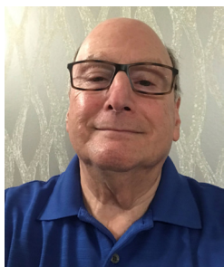
MEN'S CLUB PRESIDENT