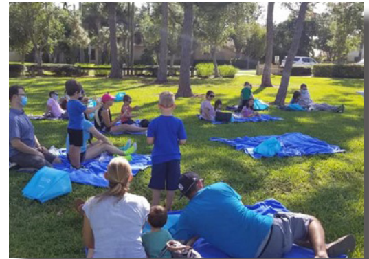
Families enjoying singing along to Shabbat tunes