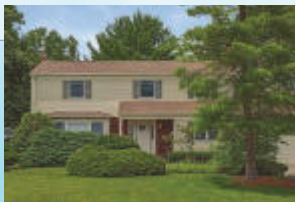
13 Guernsey Lane Colonial Oaks

557 Cranbury Rd, Ste 23, East Brunswick, NJ 08816