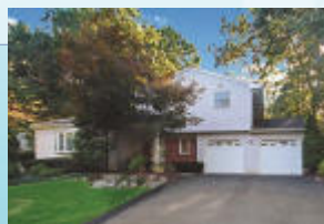
18 Bosko Drive Frost