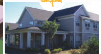
STEIN ASSISTED LIVING

To schedule your private tour, call Regency at Wilf at 732-873-2000 or visit RegencyHeritageNursing.com