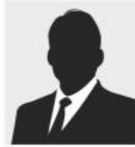
Our future is coming

At Menorah Chapels, we've been serving the Jewish community for over forty years... and we will continue to serve with honesty, integrity and dignity for many years to come. We are the only strictly Jewish funeral home in Union County that maintains its own building and are not affiliated with any other funeral home.