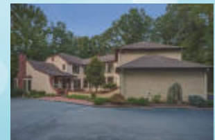
135 Fern Road Colonial Oaks

Thank you for the opportunity to EARN your trust, I am proud to be your choice!