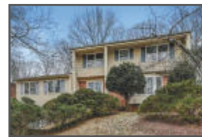
Indian Forest — E. Brunswick Sold for $499,900!

Put our family of creative, experienced professionals to work for you!