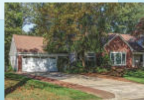
65 Patton Drive Lawrence Brook