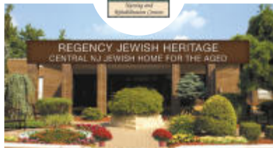
REGENCY REHAB & NURSING