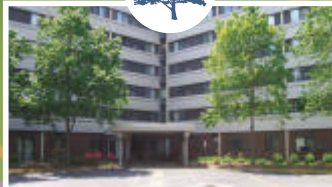
WILENTZ SENIOR RESIDENCE