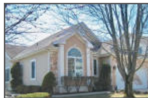
Greenbriar — Monroe 55+ Sold for $357,000!