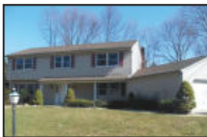
Peach Orchard— E. Brunswick Sold for $442,000!