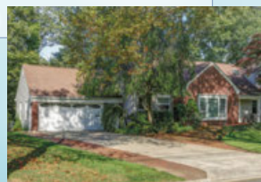
65 Patton Drive Lawrence Brook