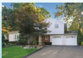
18 Bosko Drive Frost