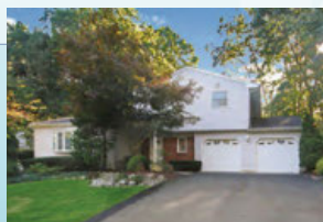
18 Bosko Drive Frost