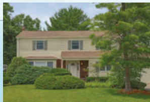
13 Guernsey Lane Colonial Oaks

557 Cranbury Rd, Ste 23, East Brunswick, NJ 08816