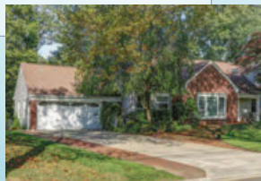
65 Patton Drive Lawrence Brook