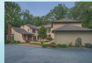
135 Fern Road Colonial Oaks

Thank you for the opportunity to EARN your trust, I am proud to be your choice!