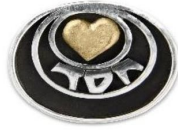
Torah Fund Pin for 5780 (2019-2020)