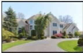
Colonial Oaks — E. Brunswick Sold for $787,500!