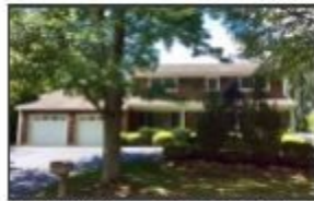
Appletree — E. Brunswick Sold for $500,000!