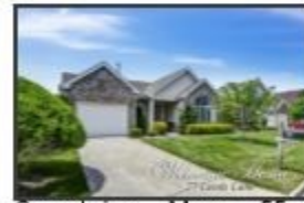
Greenbriar — Monroe 55+ Sold for $355,000!

Put our family of creative, experienced professionals to work for you!