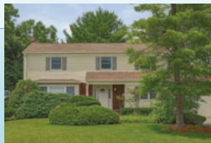
13 Guernsey Lane Colonial Oaks

557 Cranbury Rd, Ste 23, East Brunswick, NJ 08816