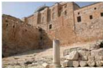
Double gate and southern steps of the Temple Mount

The Sephardi Studies Project at Stanford University in CA plans to explore the history and culture of Sephardi and eastern Jewries ( http://www.stanford.edu/dept/jewishstudies/programs/sephardi/ ). Currently the Project has books in Ladino posted with transliteration and translation available for viewing and study.