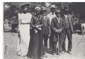
An emancipation day celebration in 1900.

Attend the 2023 Juneteenth Celebration from June 10 to 19. Click here for a list of local events .