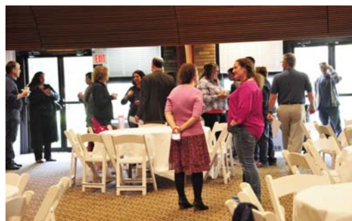
Religious School parents at the Meet and Greet