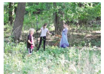
Park cleanup on September 10th