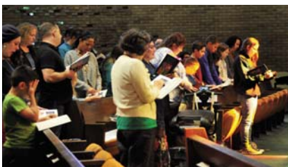
Religious School opening day services