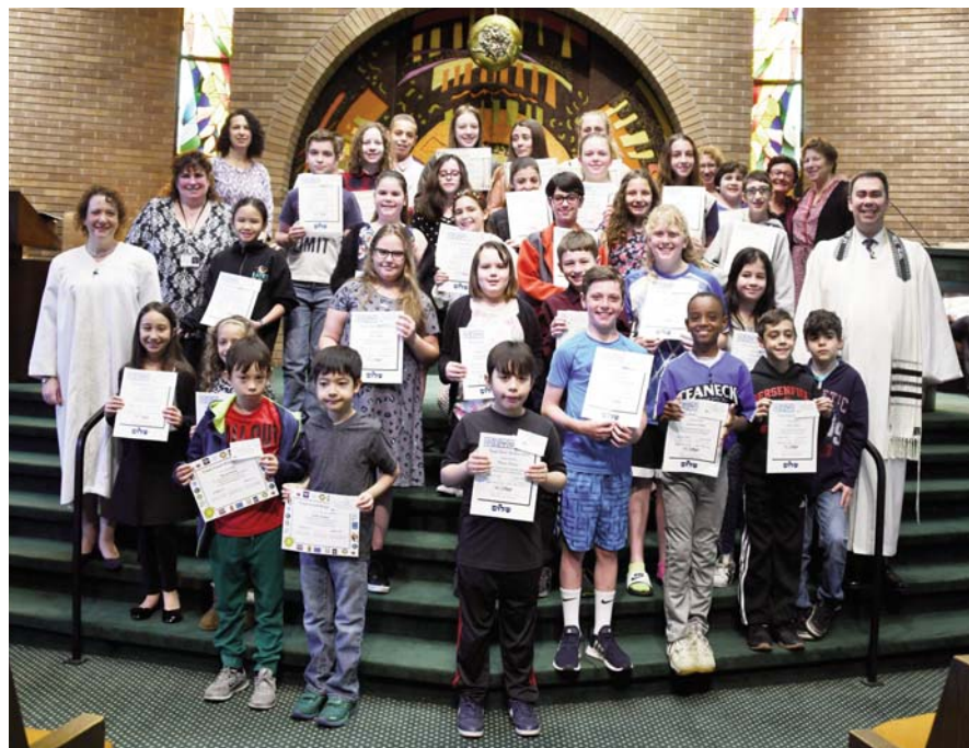
Religious School moving up ceremony on May 20, 2018