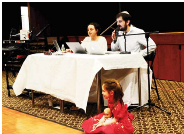
May 4th Israel Story performance, Israel trip reunion dinner, and Etz Chayim performance in celebration of Israel's 70th birthday.