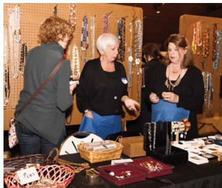
The annual Bazaar was held on December 2nd. It involved lots of hard work by many volunteers.