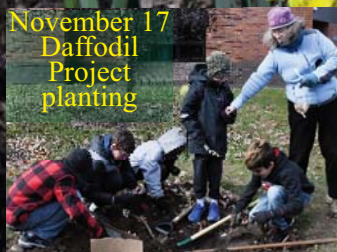
November 17 Daffodil Project planting

The Daffodil Project aspires to build a worldwide Living Holocaust Memorial by planting 1.5 million daffodils in memory of the children who perished in the Holocaust and in support for children suffering in humanitarian crises in the world today.