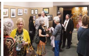
Meet the Artist Reception