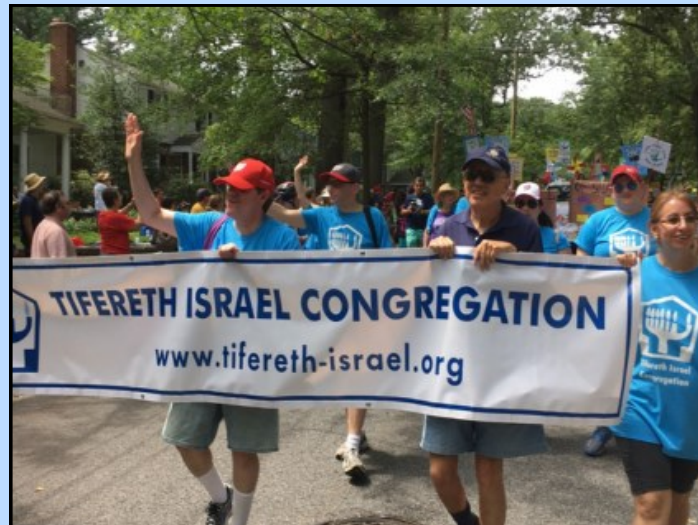
Photo from the 2017 Takoma Park Parade

Sponsored by the Membership Committee Tuesday, July 4 at 10:00 am