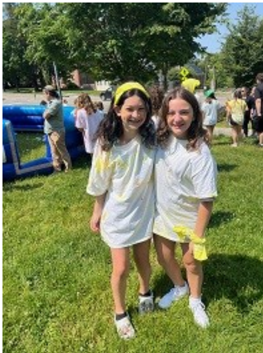
Color war