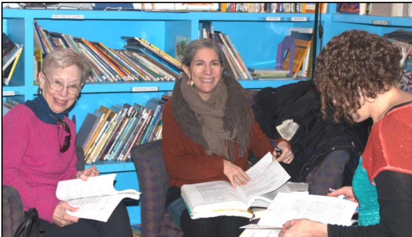
Hebrew class in library nook