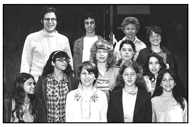
Students at TI in 1976. If you can identify any of these individuals, please contact the Centennial Committee.

The Tifereth Israel Centennial Committee is collecting memorabilia from Tl's history for use in our upcoming 100-year anniversary (2016-2017). We are especially interested in any of the following: